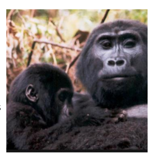
Baby gorillas drink milk from their mothers for the first 3 years of their lives.

Mountain gorillas are born one baby at a time. Gorilla babies weigh about 3-4 pounds when they are born [the same as 2 bags of sugar]. They learn to crawl at about 2 months old and walk by the time they are 8-9 months old.