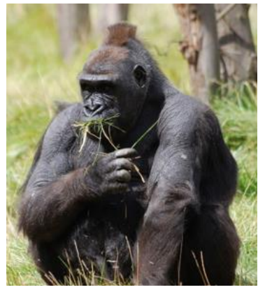
Mounts gorillas are omnivores

Mountain gorillas do eat bananas, but they also eat insects and worms. Animals like mountain gorillas that eat both plants and animals are called omnivores . Mountain gorillas have started to have trouble finding food because people have chopped down their forests to turn the area into farmland and houses.