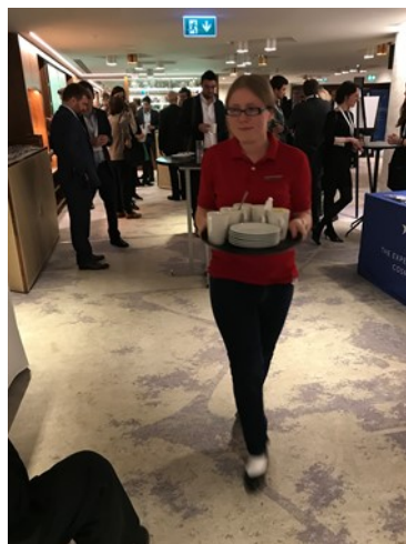
December - Daisy