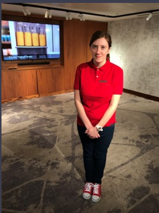
Aimee Conference & Banqueting