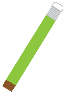
an unsharpened pencil with a rubber at the end