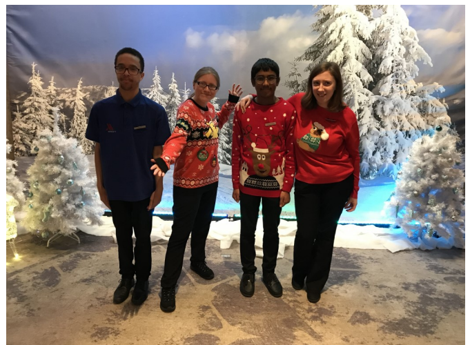
Christmas Jumper Day 13th December