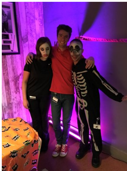
Halloween 31st October