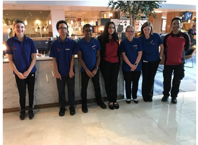
National Smile Day 4th October