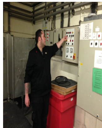
Brian Wallington Engineering