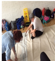
Production Club backstage art crew 2018 mak- ing props

Along with the Support of dance club, production club Pupils have written the script and created there own dance routines and help out . 6th form have also helped in dance to create the routines and teach them to others,