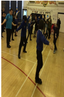
Production Club rehearsals 2018

Along with the Support of dance club, production club Pupils have written the script and created there own dance routines and help out . 6th form have also helped in dance to create the routines and teach them to others,