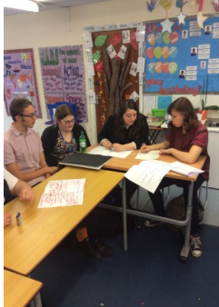
Script writers club 2017

Welcome to West End High. This years production has been written in a team of our students from year 11 and 6th formers. It is an original story created by using our favorite musical theatre characters and their best musical numbers!