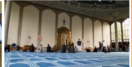
Regents Park Mosque, London