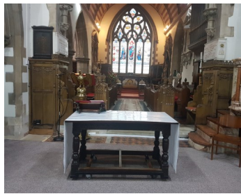
St. John The Baptist Church, Hillingdon