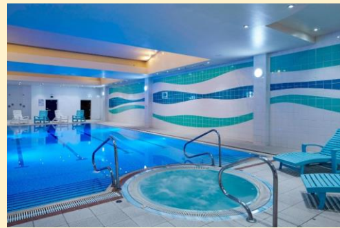
Swimming Pool & Jacuzzi